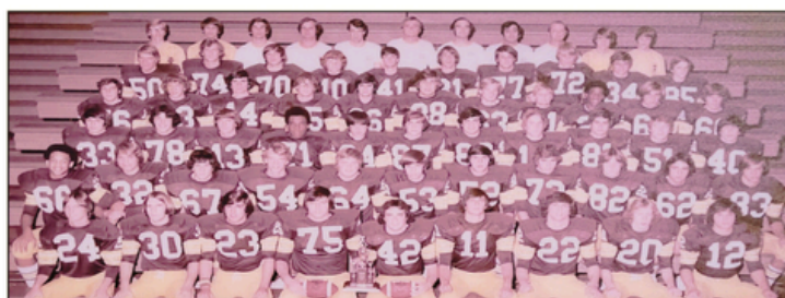
1975 FOOTBALL TEAM ATHLETIC RECOGNITION

To register, please go to: https://alterhs.org/2025-hall-of-fame/