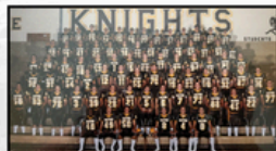
2000s Back-to-Back State Championships

Alter players have always risen to the occasion, embodying the spirit of what it means to be an Alter Knight. Some have not only achieved remarkable success in high school but have gone on to excel in college and professional football.