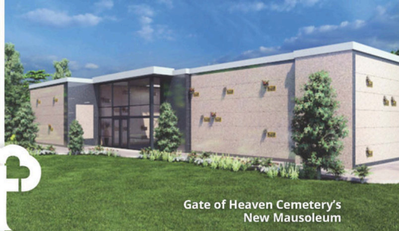
Gate of Heaven Cemetery's New Mausoleum